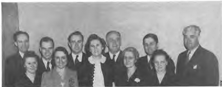
First Graduates of B. B. I. with President and Dean

During the past four years the Baptist Bible Institute of Cleveland has been housed in the Educational Building of the Hough Avenue Baptist Church. We are deeply grateful to the Pastor, officers and members of the Hough Church for providing free facilities to the Institute.