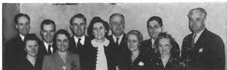
First Graduates with Dean and President