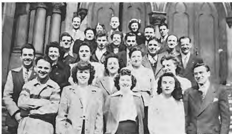
Day School Freshman Class—1947