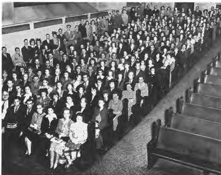
Evening School Students—1942