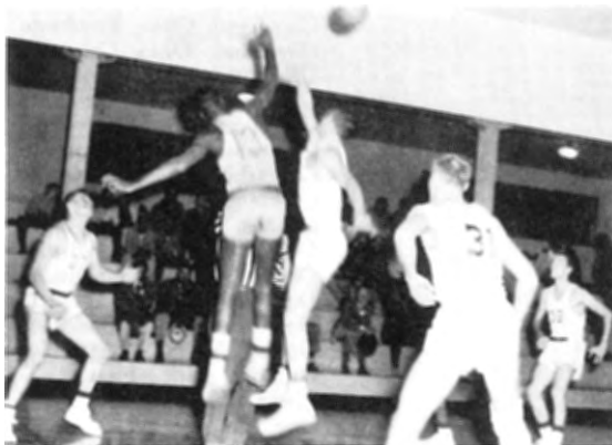
Basketball game with Wilberforce University