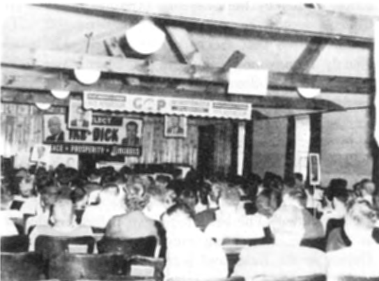
"Political Rally" when each student "voted" for his favorite presidential nominee