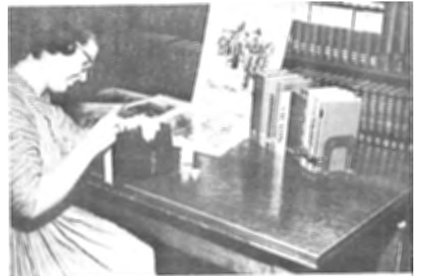
Display table with student numbering books

During the past year nearly 1,000 new books have been added to our library including twenty additional sets of reference works for student and faculty research. Soon to be ready for use are an information pamphlet file and visual aid department. We have the beginnings of a microfilm library and a new children's foreign language book section.