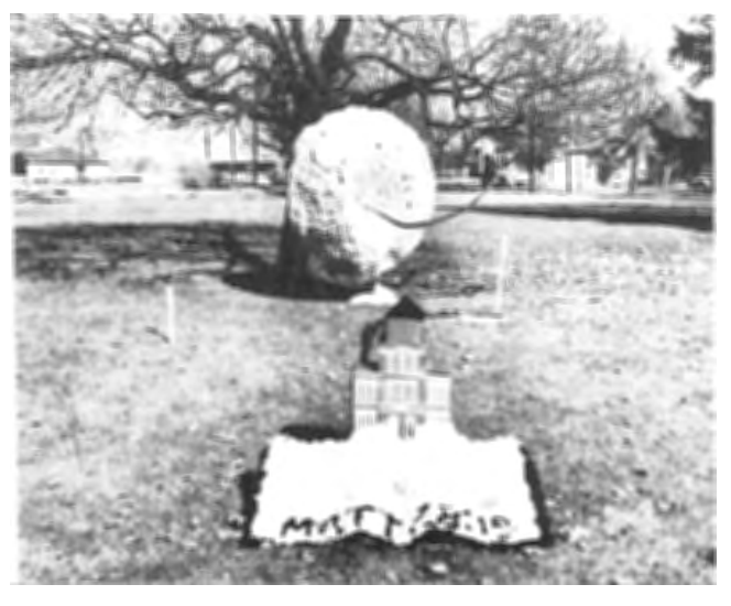
Alumni Homecoming Displays