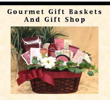
Helping you share the special moments with the people in your life

20 N. Fountain Avenue in downtown Springfield 937-324-9774