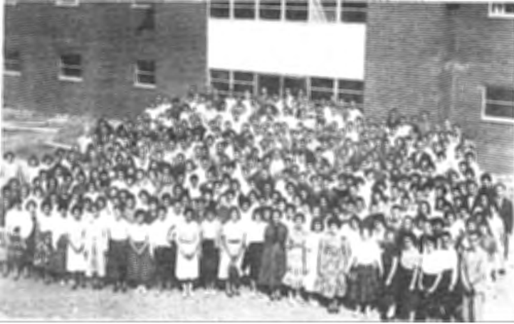
COLLEGE FAMILY SEPTEMBER 1960

Our students need and want this new building. Their interest has been demonstrated by their willingness to raise over $18,000 for the project by May 1st. In a recent chapel service, 184 students said they would try to give or raise $100 each by that date.