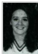
Summer Bennington 676 rebounds (1995-98)