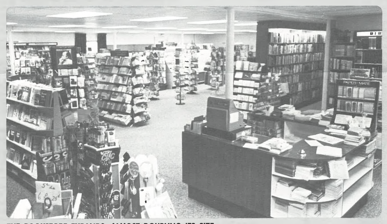
THE BOOKSTORE EXPANDS, ALMOST DOUBLING ITS SIZE