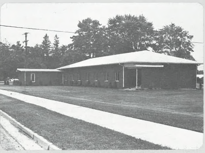
THE NEW PROFILE OF PATTERSON HALL