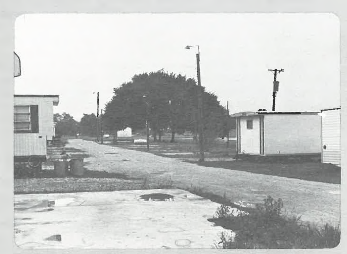
BELIEVE IT OR NOT - THE TRAILORS ARE GOING