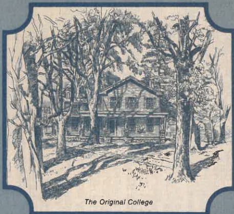
The Original College