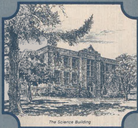
The Science Building