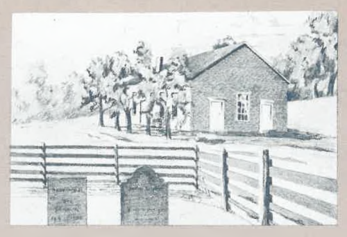
THIRD CHURCH (1839)