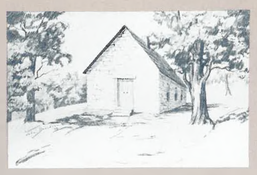
SECOND CHURCH (1824)