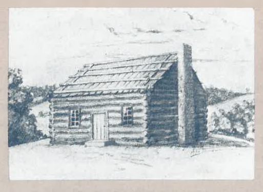
FIRST CHURCH (1812)

one-fourth of the time. He also stirred the congregation to build a more comfortable house for public worship, which was opened in 1824. It was erected on a lot two miles east of the old log church, six miles from Xenia and two miles from Cedarville, on the bank of Massies Creek. In 1839 the congregation purchased another lot of ground adjacent to the old one, and built thereon a new church of brick. In 1853 the congregation determined to pull down the brick church and rebuild it in Cedarville, that being a more central place. By this time the old stone church was not fit for use, and those using it, not thinking it the right place for them, gave up their interest. Its materials were also used in the construction of the new edifaces in Cedarville. Thus the fourth church had in it materials from the old churches of 1824 and 1839. The building was of brick, 45 x 67 feet with a twelve-foot vestibule, and was finished inside with the same pulpit and pews that were in the former church. (This fourth ediface is the one that was purchased in 1902 by Mr. William Alford, and donated to Cedarville College as a gymnasium, receiving the name of Alford Memorial, in honor of his parents, Rev. and Mrs. John Alford.)