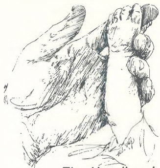
The Handiwork of God