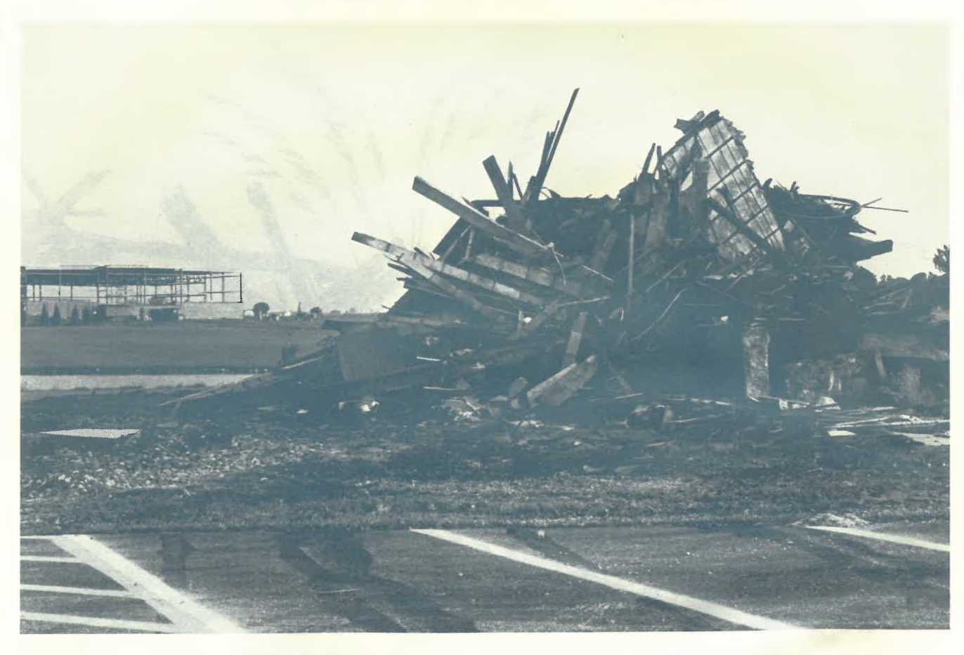
Up with the new . . . . FIELDHOUSE