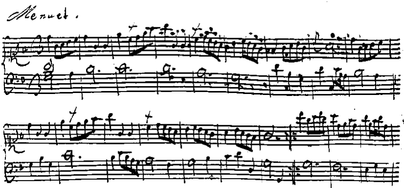
Figure 4: Familiar minuet tune (mm. 1–19) by J. S. Bach. Simple yet stately. 44

Bach spent a great deal of his career in courts throughout Germany. During this time, many German courts invited French dancing masters to deliver instruction regarding the elegant styles of French dance. As a result, Bach was exposed to some degree of training from French dancing masters, and he was additionally influenced by the ideals of high society in France. 40 Bach's exposure to French society was "an intrinsic, important, and graceful component of Bach's world, and...his titled dance music reflects the noble and subtle movements of early ballet." 41 Ultimately, as Bach's music became increasingly popular throughout Germany and Europe, his French dance compositions likewise gained a stronger foothold. Specifically, Bach composed twenty-eight titled minuets (Figure 4), which reflected the noble, graceful, and political qualities of original French minuets. 42 Bach also composed bourrées, which included rhythmic, melodic, and stylistic elements that were similar to those of original French bourrées. 43 These are just a few examples of Bach's prolific involvement in composing French dance music. J. S. Bach is yet another prime example of the influential composers who contributed to the composition, publication, and availability of French dance music throughout Europe.