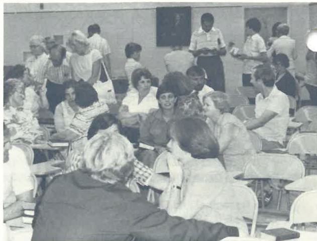
Alumni rediscovering each other.