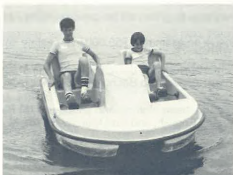
Alumni children preparing for the future.