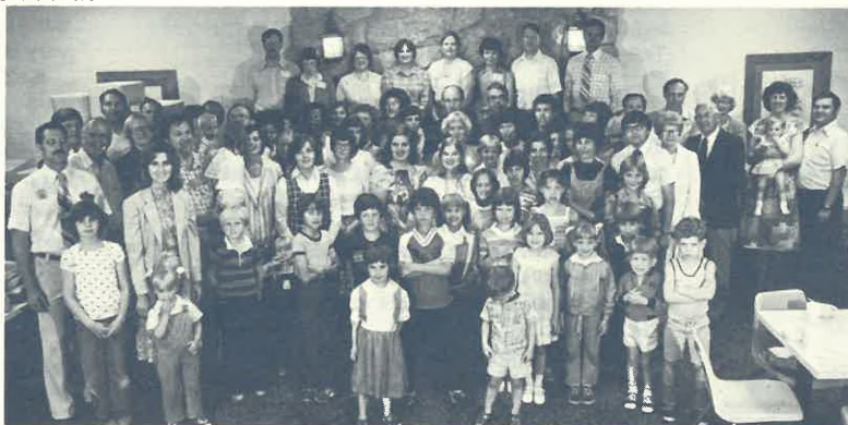
A "cheese" break during the ice cream social.