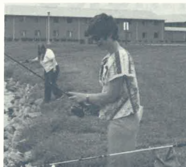
You should have heard the story about the one that got away.