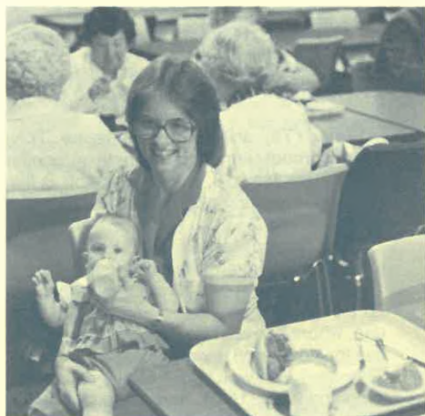
Mother's dinner got cold while future alumna enjoyed lunch.