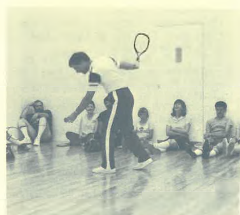
Remember, class, it's all in the wrist!