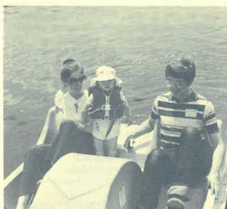
Cedar Sea (Cedar Lake) offered conference participants recreational enjoyment.