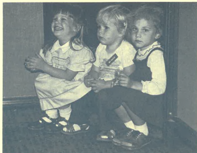
Class of '04 – 2004, that is!