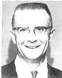
L. Bert Frye Physical Science

The philosophy of Cedarville College is to provide both a sound Christian atmosphere and training coupled with academic excellence. To achieve the latter, many of our faculty are pursuing advanced degrees.