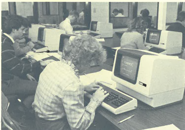
Cedarville College academic computer facilities include a DEC VAX 11/750 minicomputer. Adjacent to the computer room are 17 terminals in a student and faculty lab which provide direct access to the VAX.