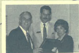
Distinguished Service Award