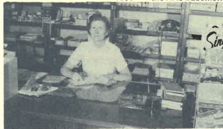
1956 — Fine Arts basement