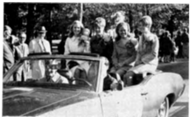
The Queen's Court enroute during parade.