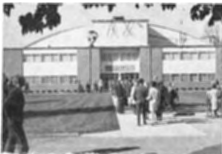
Campus focal point immediately following the Homecoming Parade.