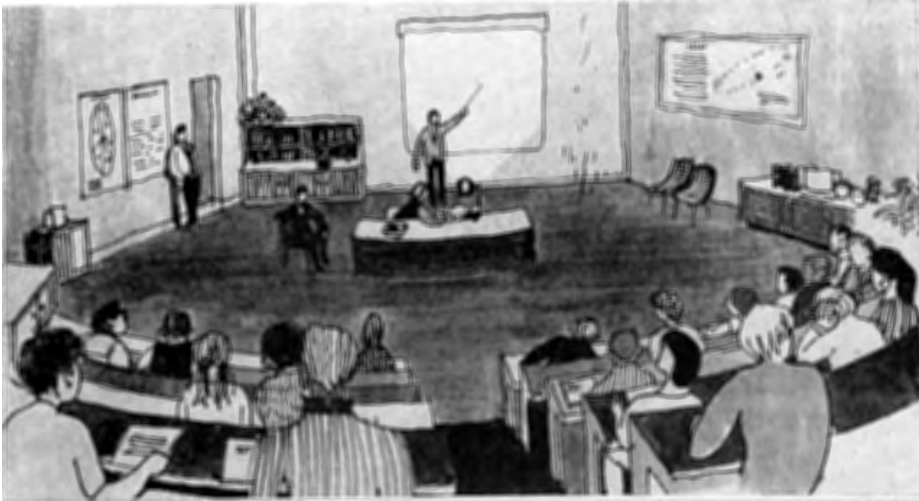
Science Center Lecture Hall

The Science Center pictured on page 1 will feature the present science building that will be remodeled and used exclusively for biological sciences. The present science building will be connected by a glass-enclosed corridor with a solarium located midway and the new Science Center will be constructed around the shell of Williams Hall. The first floor of this building will be used for physics and the second floor for chemistry.