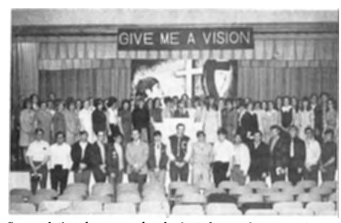
Some of the almost one-hundred students who responded to the dedication of service to missions.