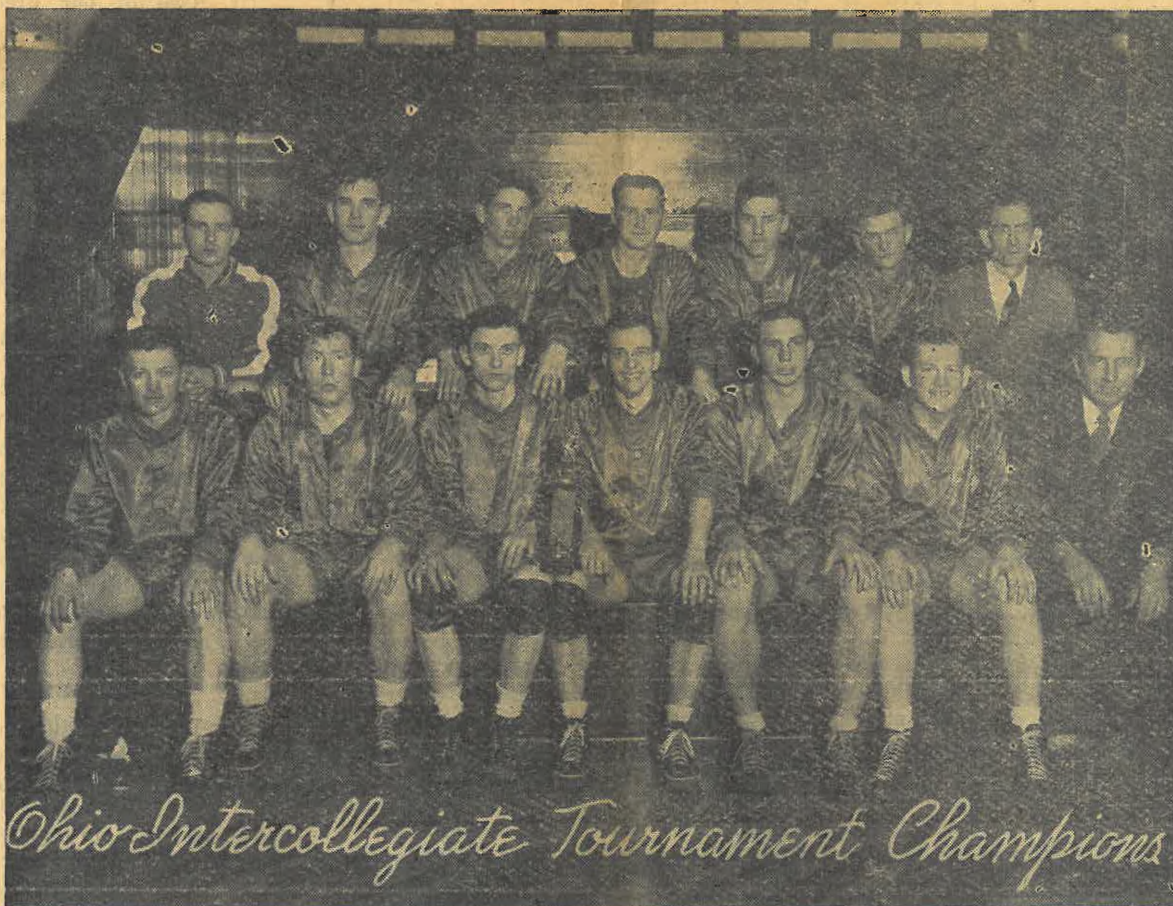
Ohio Intercollegiate Tournament Champions

The Junior Varsity won eight and lost five. One of their most cherished Victories was over Wilmington College J. V's.