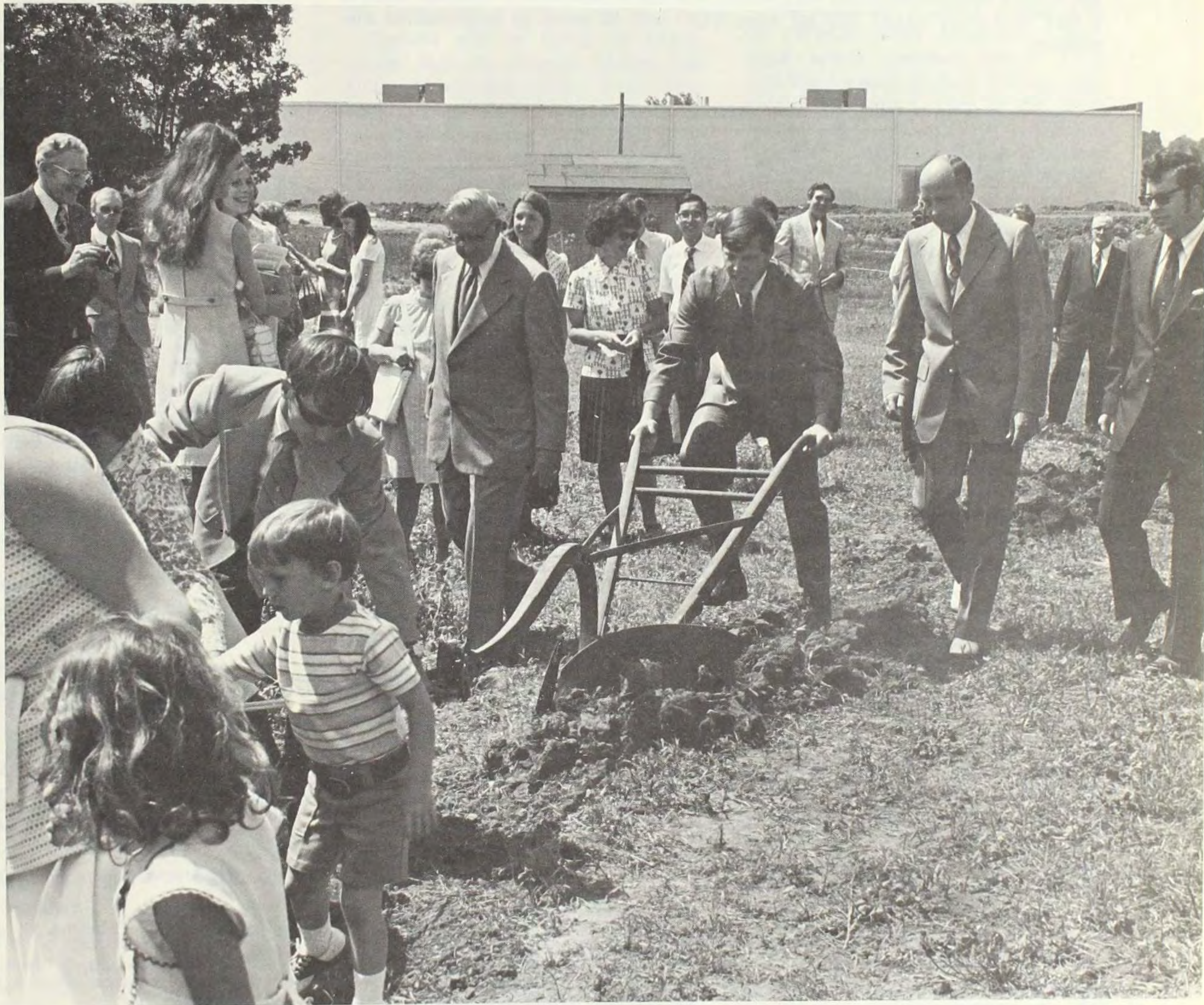
Ground Breaking At New Church Site