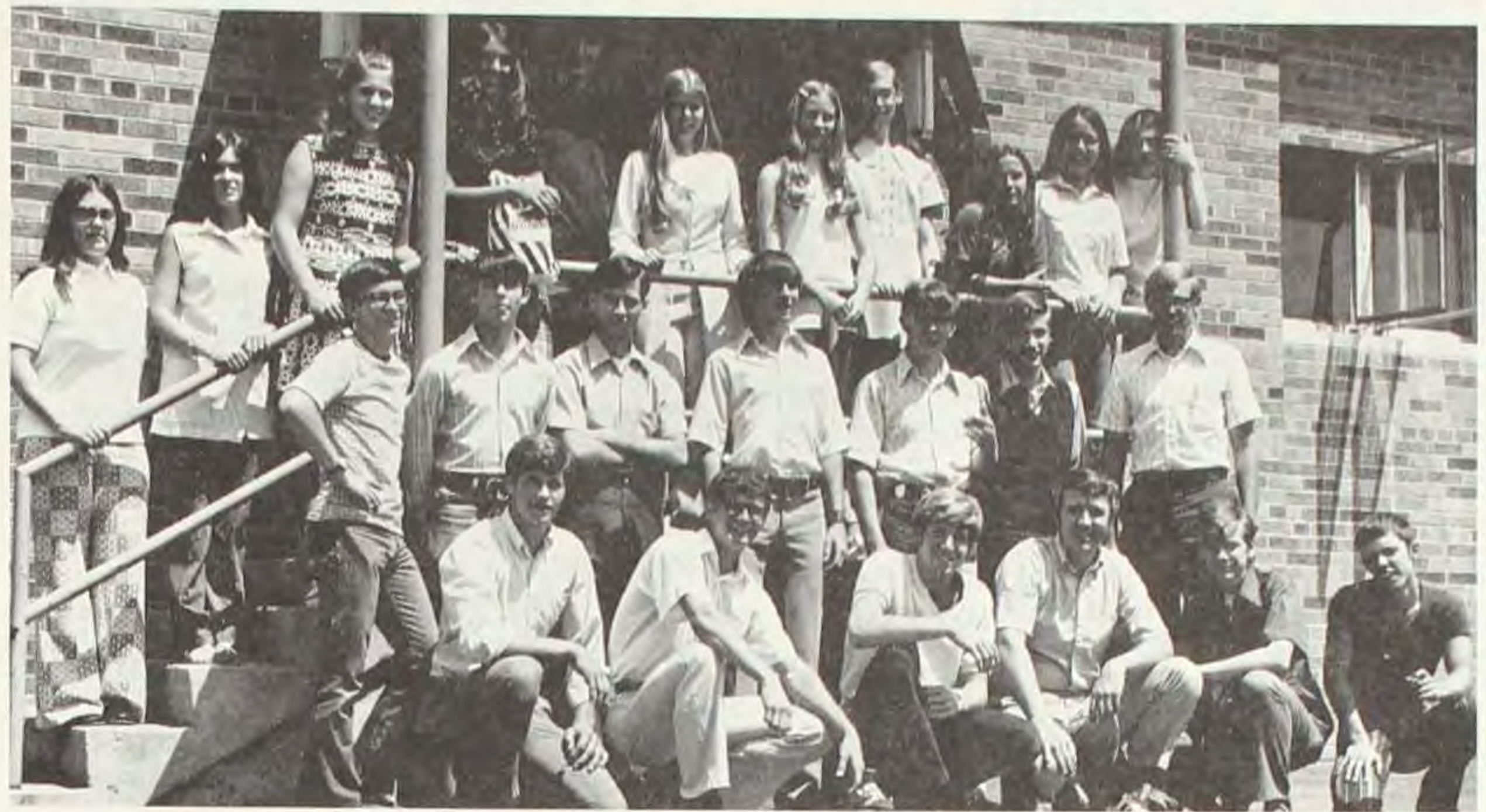
SOME OF EMMANUEL BAPTIST'S HIGH SCHOOLERS