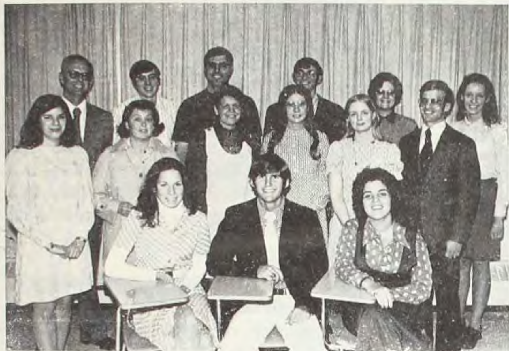
O CONJUNTO MUSICAL

DA UNIVERSIDADE EVANGÉLICA "CEDARVILLE" (EUA) NO DIA 9 DE JUNHO, ÀS 19:30 hrs. - No Salão do ACM Associação Cristã de Moços - Rua Nestor Pestana 147 - Centro (perto da Praça Roosevelt - em frente da Catedral Evangélica) Patrocinado pelo Seminário e Instituto Bíblico Batista