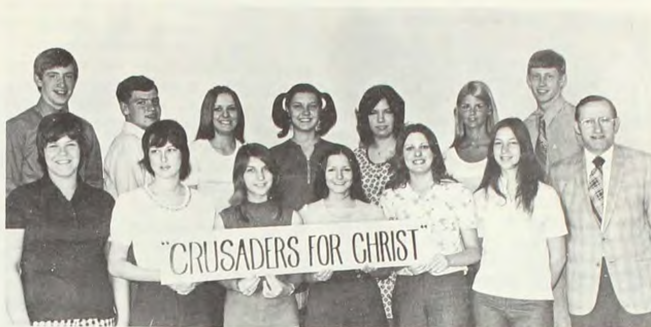
A VERY ACTIVE GROUP