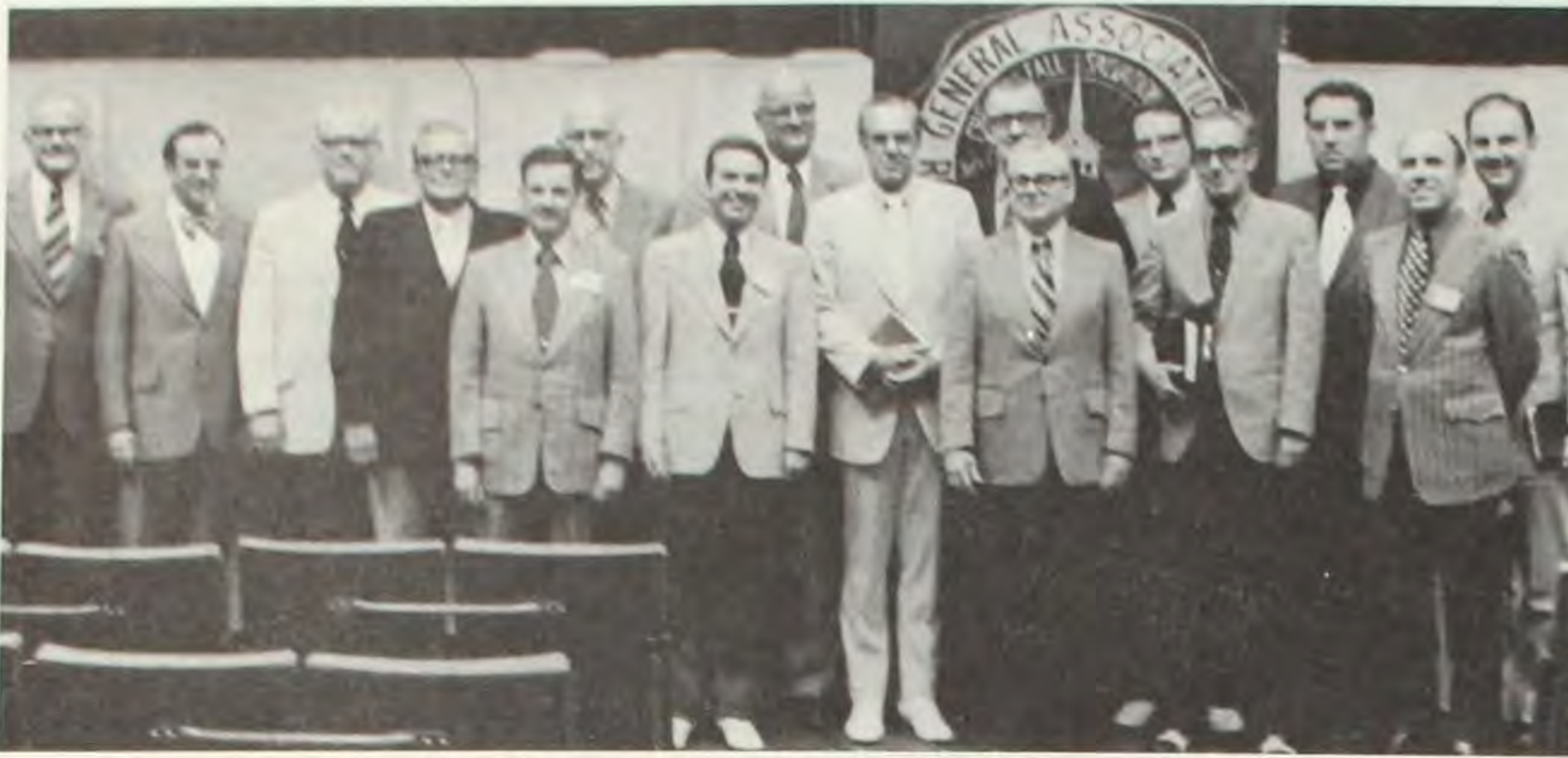
COUNCIL OF EIGHTEEN

Those who attended the 42nd Annual GARBC conference in Kansas City, Missouri, June 25-29, had a most delightful time.