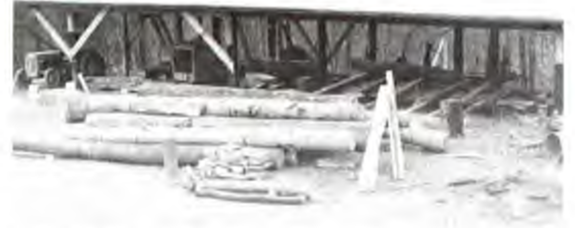
Scioto Hills' "miracle sawmill"

On a certain Friday several months ago, the owner of a sawmill gave us his price for selling. As we left this man's home, we told him that God would have to provide this money in a miraculous way. Driving home, we prayed that God would provide one-half of the purchase price of the mill before the camp board meeting, which was in one month. Two days later God used someone to give a gift of over $2,000. Other gifts were provided and the day before the board meeting God had provided the remaining $500, the amount of one-half the price of the mill, through the sale of an old trailer. That was a miracle in itself, as the trailer was in such poor shape we thought we would have to pay someone to move it. This mill is housed under a 36' x 60' pole building, and will enable us to cut timber from our own land to use on other new projects. Next we are planning to cut lumber for a new A-frame for this summer.