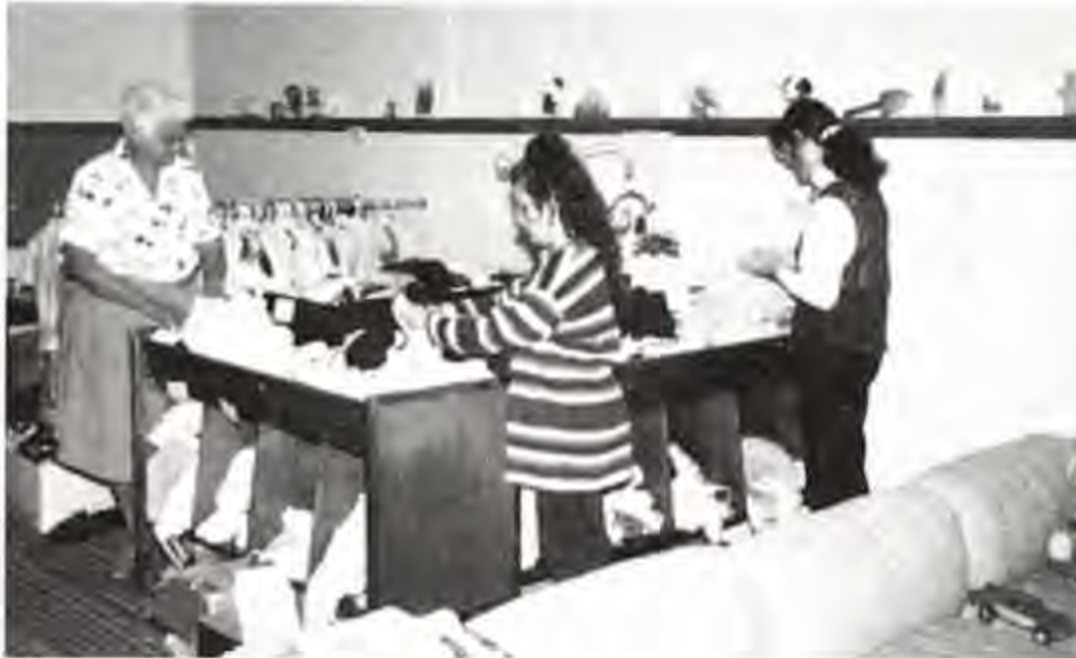
Volunteers at the MRC sort clothing.

D uring 1993 the Maternity Resource Center (MRC) of Baptists for Life of Central Ohio gave assistance to women in crisis pregnancies 366 times. In addition to baby items and maternity clothes, several hundred gospel tracts and over 150 Bibles or Bible portions were also given out. One client came to know the Lord as her Savior. All this was accomplished with the MRC only open Saturdays from 10:00 a.m. to 1:00 p.m. and Wednesdays from 6:30-8:00 p.m. (about 230 hours over the course of the year.)