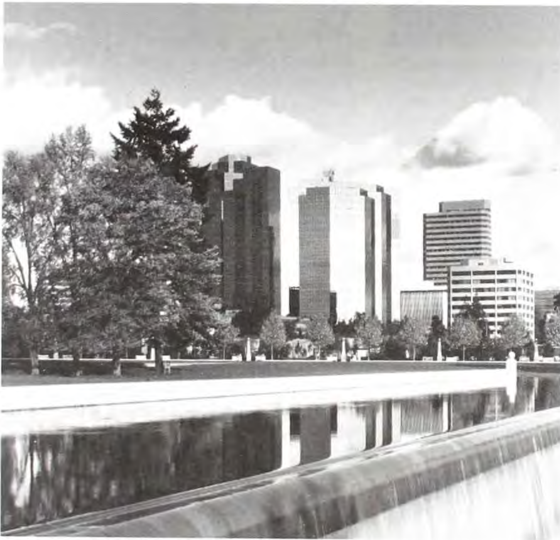
Downtown park in the heart of Bellevue, just minutes from hotels and shopping.