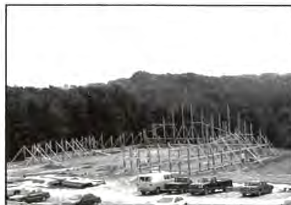
Dining Hall under construction

W e have an expression here at the Ranch—it is a very simple one—"Oh, wow!" It talks about the greatness of our Lord and Savior Jesus Christ and His mighty works. When campers walk through the woods and find something neat the expression is, "Oh, wow!" When they are riding the horses and see the beauty of God's creation the expression is, "Oh, wow!" When counselors explain about the work of God in the lives of one of our campers the expression is, "Oh wow!" When a young person comes to know Jesus Christ as Savior after struggling with that decision, the expression is, "Oh, wow!"