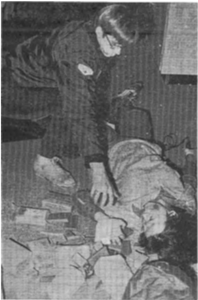
. . . to comfort . . .