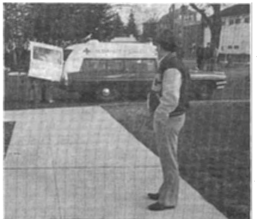
. . . to Greene Memorial Hospital to be treated.

Although the events of December 3rd were only simulated, it could happen. With this in mind, the AX rescue squad staged this mock disaster. According to those who organized it, they "basically wanted to evaluate the squad's performance in an emergency situation of this dimension." They were joined in this endeavor by many of the area rescue units.