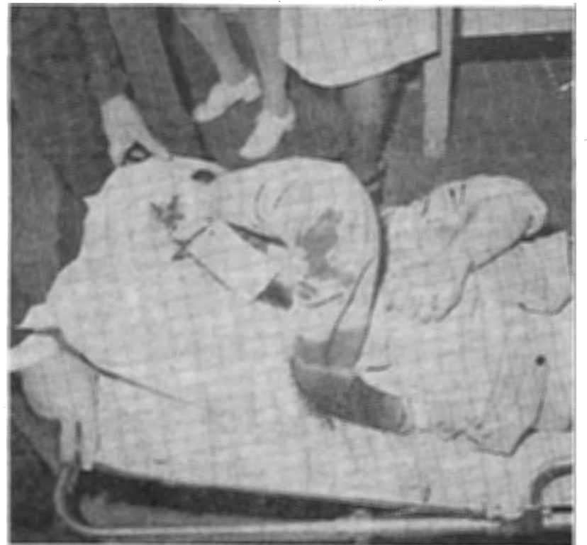
. . . and to transport the victims . . .