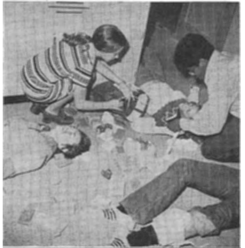
. . . moving quickly to bandage . . .