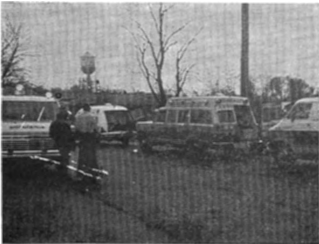
Within minutes the sirens began to scream and the rescue units began to arrive . . .