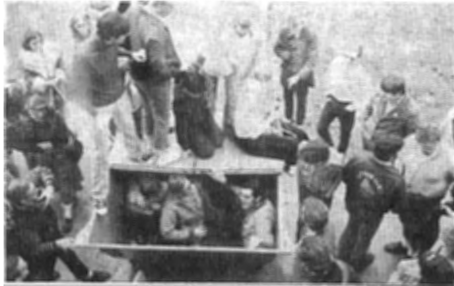
Contest to see how many could get in the dumpster.