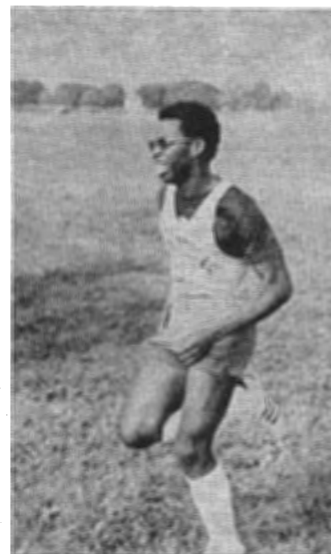
Harrier completes course

With this year's improvements and the return of most of the runners, next year's team could be strong.