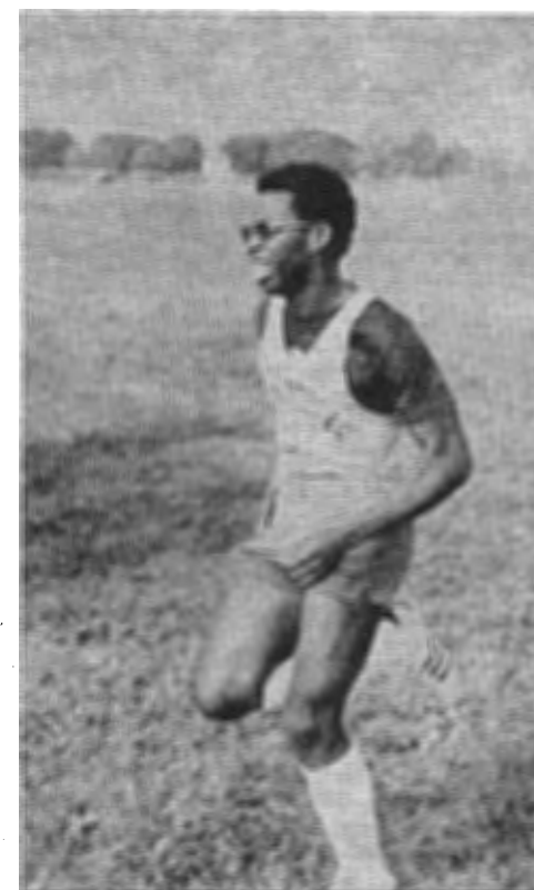
Harrier completes course

With this year's improvements and the return of most of the runners, next year's team could be strong.