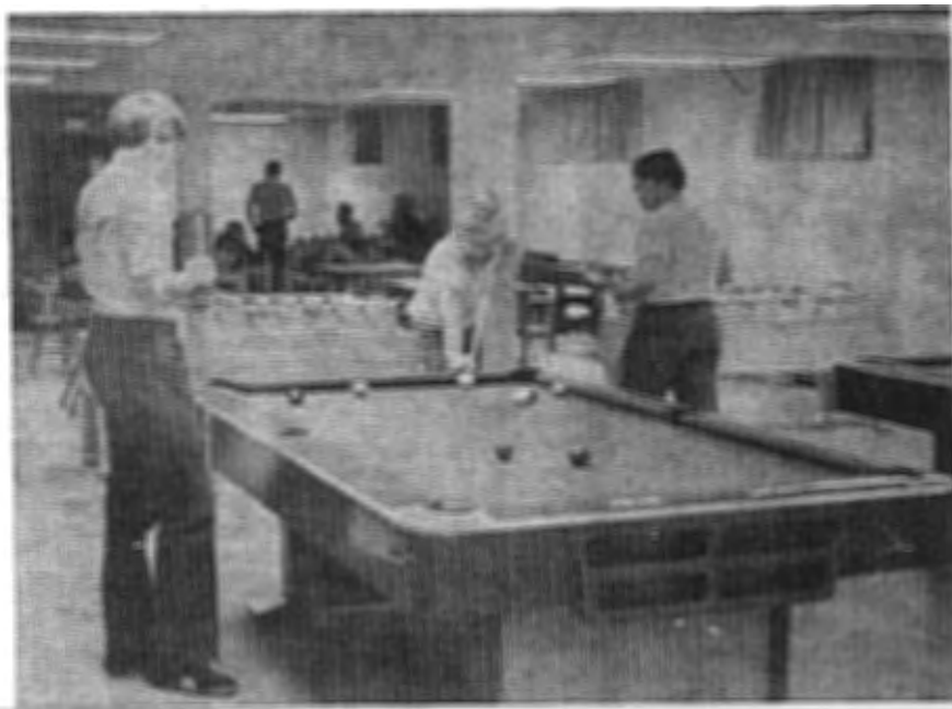
Students "marshall" their efforts to win at the new facilities at Marshall Hall.