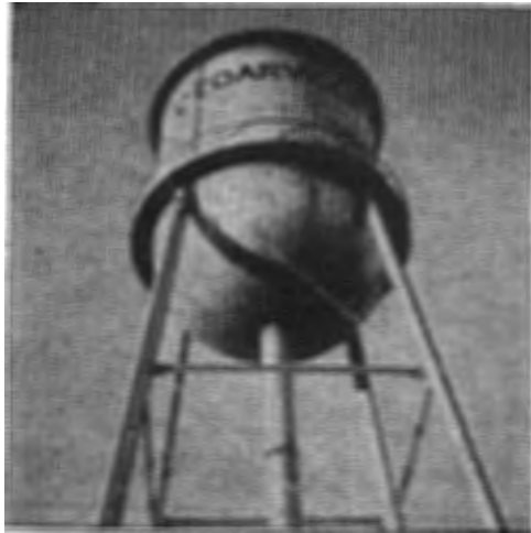
Old watertower, located at the corner of Bridge and Creamer, has to suffice for a while longer.