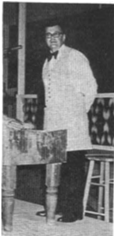
Dr. Monroe says that Chinese cooking is exceptionally healthful and can be very economical.

Note: Certain vegetables can be deleted or added depending on availability. Other possible ingredients include: zucchini, carrots, cucumbers, and snow peas.