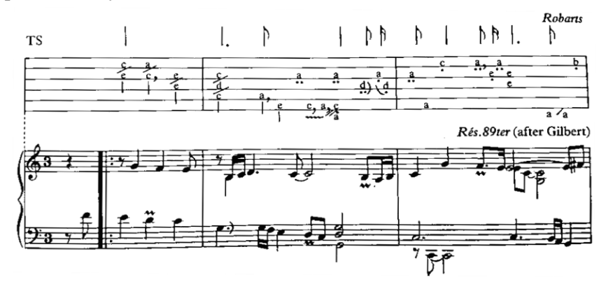
Figure 3 : D'Anglebert's keyboard arrangement of courante "La pleureuse" by E. Gaultier, mm. 1–3.44

Within the many sources that discuss harpsichord history, the lute's influence is usually contained to the style brisé . The style brisé , however, was not a term defined by the seventeenth-century harpsichordists; rather, it first appeared in scholarly texts of the twentieth century as a historical term.<sup>45</sup> Is the style brisé what François Couperin refers to, then, when he vaguely mentions his use of " les choses luthées ," or "things of the lute?"<sup>46</sup> Although many harpsichord works were obviously or explicitly written to imitate the lute, it is most likely that "there was not a conscious attempt to create a lute style as such but only a gradual accrual of traits."<sup>47</sup> Perhaps, Couperin may have been referring to genre, texture, form, timbre, sound effects, harmony, ornamentation, or any combination of these, since the harpsichord was obviously influenced by much more than the lute's style brisé .48