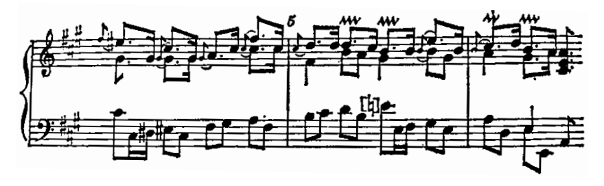
Figure 9 : Inter-measure port de voix in F. Couperin's "La covalescente," mm. 5–7.97

was the port de voix, which could be described as a "decorated appoggiatura."90 For all melody instruments and vocalists, the port de voix occurred as an anticipation of the beat.91 At least five organ treatises of the seventeenth century also indicate such a prebeat performance of the port de voix .92 The lute, however, often played a port de voix exactly on the beat.93 Starting in the 1670s, the port de voix showed up in harpsichord ornament tables. The harpsichord ornament, diverging from the organ style, was often placed on the beat, like the lute.94 Yet, some will suggest that "the well-known and widely quoted onbeat patterns of D'Anglebert and his followers were not representative of common keyboard practices of the era in question." They argue that "those [onbeat] patterns were limited to certain masters."95 However, because all of the composers that commonly used this onbeat ornament, including D'Anglebert, Chambonnières, Couperin, and Le Roux, were also the ones that are most known for imitating the lute in their writing, it follows that this was done in purposeful imitation of the lute. Yet, the harpsichord ornament (Figure 9) also deviated slightly from the lute tradition, often adding an extra sixteenth note to the beginning. Further, it is evident that "some of these same masters used the prebeat side by side with the onbeat style," even developing an inter-measure style.96 This shows the flexibility of the harpsichordists to adapt and blend traditions.