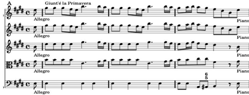
Example 1: Spring, from The Four Seasons, mm. 1-3

religious or profane spheres.” 2 These “profane spheres” included the accompaniment of secular activities such as dancing, processions, ceremonies, and chamber music. Similarly, in the seventeenth century, the cello was to play the basso continuo line to make a stark contrast to the solo line. After 1640, the cello became the major basso continuo instrument and an example of this basso continuo playing can be seen Vivaldi’s Spring (See Ex. 1), with the cello playing the bottom line. 3