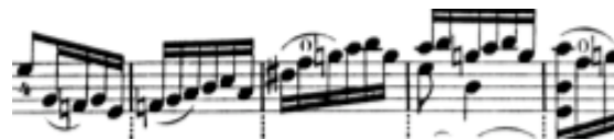
Example 18: Suite No. 5, Prelude, mm. 55-63 - Tenor Answer

Even more intricate than the four voices is the effect of the duet between voices within the subject itself. This fugue section demonstrates how virtuosic the cello can be, by playing multiple voices in one melodic line. Bach continues with this virtuosic playing in the sarabande (See Ex. 19) which contains wide skips in an "other-worldly quality." 50