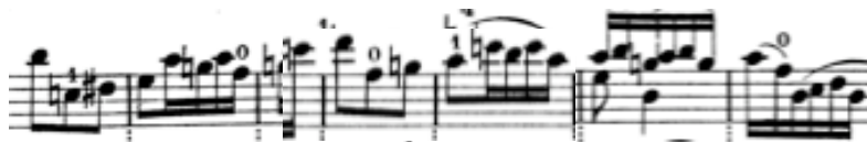
Example 16: Suite No. 5, Prelude, mm. 35-43 - Cantus Answer