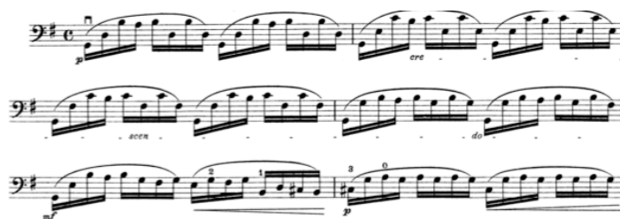
Example 4: Suite No. 1, Prelude, mm. 1-6

Another interesting element, relating to texture, is Bach's use of "musical space" (See Ex. 4) which is seen in the opening four measures which have a wide range in steps, then return to normal in measures 5, 8, and 18, and then narrow in measures 6, 11, and 13-15. 31