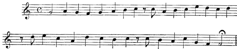
Example 1.4 Plain song melody, modified to fit the German translation, 1525 (Liemohn 1953, 9).

In 1525, Luther began developing a Mass in the vernacular, which became the primary vehicle for congregational singing. He had purposefully delayed, partly because he did not desire to remove all Latin from the service, “as if the reformation of the church depended on the exclusive use of the German language” (LW 1965, 53:53). In contrast to the prevalent assumption that Luther led the way in establishing a vernacular Mass, history reveals that many undertook the task prior to Luther. In fact, Karlstadt, the iconoclastic radical, was the first to introduce an entirely German Mass in 1522, three years earlier (Herl 2004, 4). During the years following Karlstadt’s revolutionary action, German liturgies multiplied. Few included any music at all, and those which did attempted to fit the