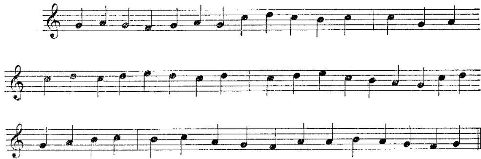
Example 1.3 Plain song melody (Liemohn 1953, 8).