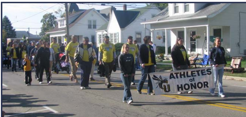
Cedarville University Athletes of Honor along with members of the CU Athletic Department participate in the 2010 Homecoming Parade on Saturday, October 2, 2010.

This year 144 former Yellow Jacket athletes were honored. The group also includes some who were inadvertently missed by the Legacy Committee and some who were unable to attend the 2009 Homecoming event.