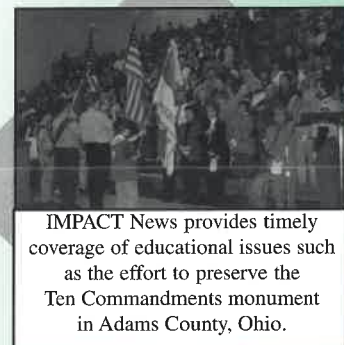
IMPACT News provides timely coverage of educational issues such as the effort to preserve the Ten Commandments monument in Adams County, Ohio.