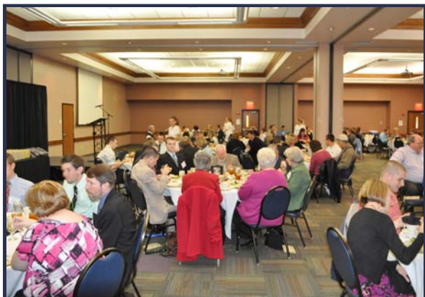
The annual CU Athletic Honors & Appreciation Banquet was held in the Stevens Student Center.