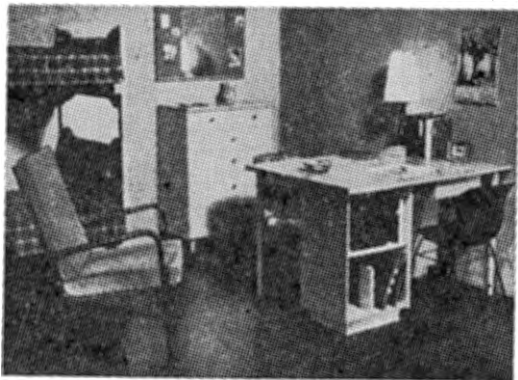
Girls' Dormitory Room