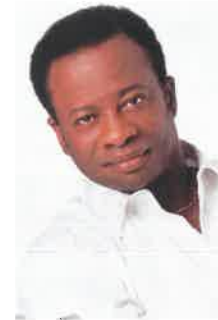
Larnelle Harris Five-time Grammy Award-winning musical artist