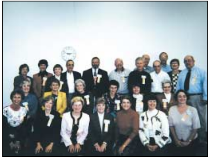
Class of 1965