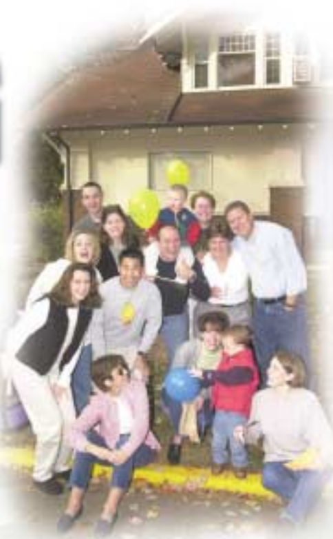
The parade route is always the perfect place to catch up with old friends.

Don't Miss Homecoming 2001 on October 12-14