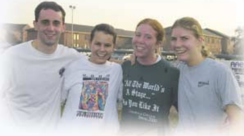
Fifty-four alumni and friends participated in the early-morning 5K Road Run.