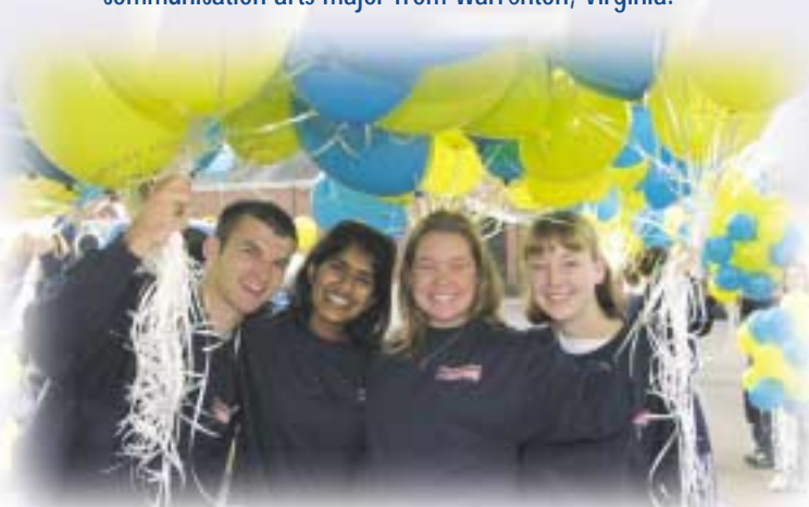
Eager to provide balloons for parade onlookers, these students are full of school spirit.