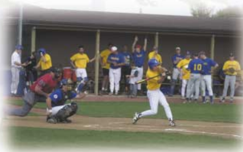
Twenty baseball alumni returned to take part in their annual alumni game and even ventured to play the current Varsity team.