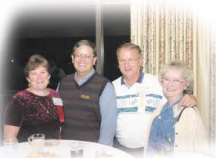
The Welcome Alumni! Dessert Reception provided plenty of time for fellowship and interaction for old acquaintances and new.