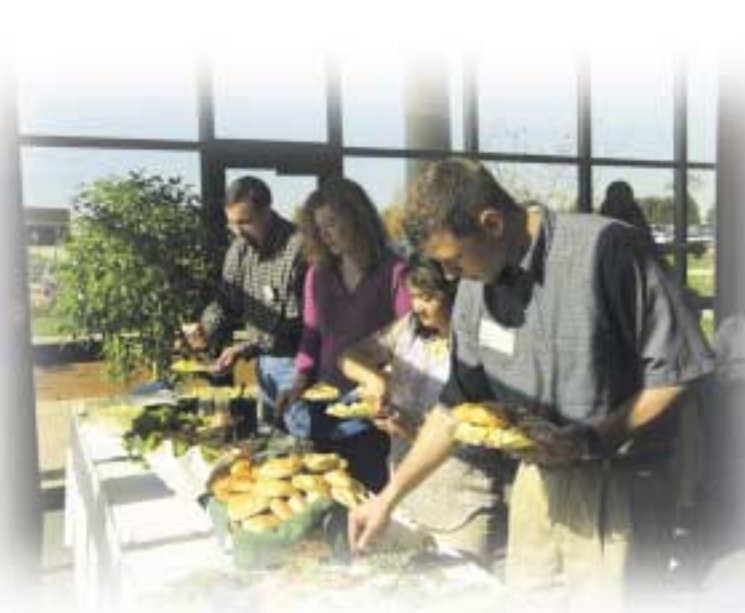
The Board Room in the Dixon Ministry Center provided the ideal location for the newly-reinstated all-alumni luncheon on Friday afternoon.