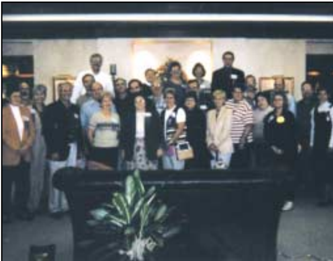
Class of 1970