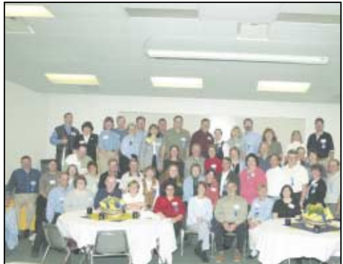
Class of 1975