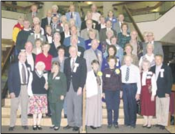
Class of 1960