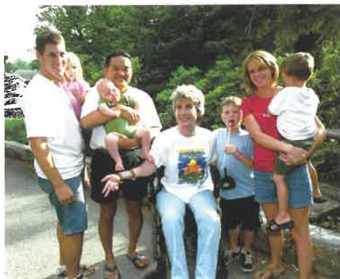
Joni enjoying some friends at one of her Joni and Friends Family Retreats