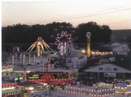
The Ross County Fair's beautiful night skyline

Join The PATH in celebrating the Ross County Fair August 5-12. Once again, our staff will set up a booth to greet longtime partners and make new friends — we'll also have a few giveaways! The Ross County Fair is rich in history and tradition and gets bigger and better with each passing year. It offers the entertainment fairgoers have come to expect along with interesting booths and talent exhibits. This year's lineup includes a junior fair night, monster truck mania, truck and tractor pull, a demolition derby, and country gospel music featuring the CCMA Vocal Group of the Year, The Fox Brothers of Nashville.