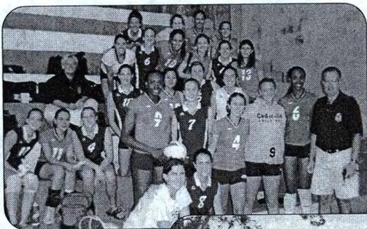
Members of the CU Lady Jackets and the Desamparados Costa Rican club team after their match. The Desamparados team included two sisters who were also members of the Costa Rican national team.

The team poses while waiting for people to show up for the first match of the trip, only to find out we had been taken to the wrong gym! Regardless, it was a beautiful mountain setting overlooking the nearby city and afforded the team an opportunity to sing and pray together.