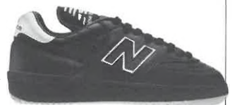
SC 699: Our lightweight indoor shoe.