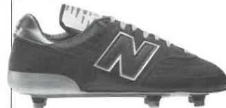
SC 1986: Soccer's most technically advanced 6-stud shoe.