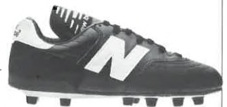
SC 874: 14-stud multi-surface shoe.