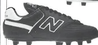
SC 214: Soccer's most technically advanced kids' shoe.