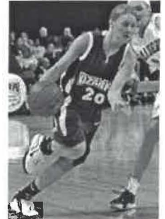
Ozarks will return four starters and 11 letterwinners.

The first regular season poll will be released on Wednesday, December 5.