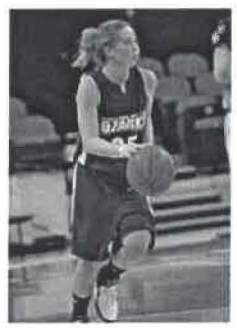
The Lady Bobcats earned 13 of the 17 first place votes.