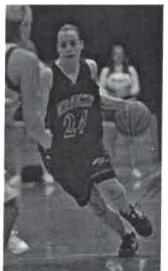
Morningside (Iowa) moved up three spots to No. 4.

Others receiving votes: Southwestern (Kan.) 64, Notre Dame (Ohio) 58, Berea (Ky.) 43, Cornerstone (Mich.) 35, Covenant (Ga.) 29, Mayville State (N.D.) 24, Taylor (Ind.) 24, Doane (Neb.) 23, Missouri Valley 13, Midway (Ky.) 11, Southern Oregon 10, Huntington (Ind.) 9, Northwood (Fla.) 8, Menlo (Calif.) 8, Alice Lloyd (Ky.) 1, Marian (Ind.) 1, Jamestown (N.D.) 1.