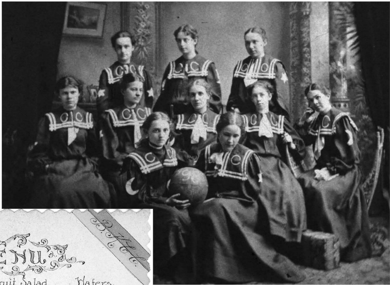
Women's basketball team, 1890s