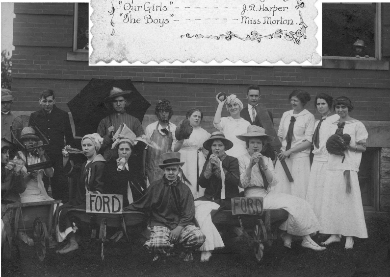
Candid photo of students, 1915