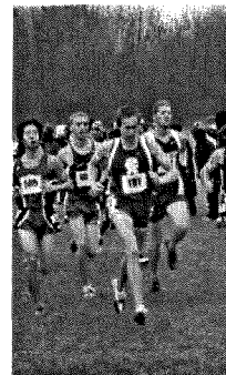
Twenty-two teams changed positions in this week's poll

The poll was voted upon by a panel of head coaches representing each of the conferences. The next poll will be released on Oct. 14.