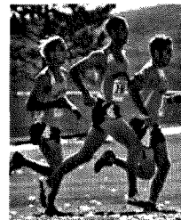
Black Hills State (S.D.) improved three spots in this week's poll to No. 13

The poll was voted upon by a panel of head coaches representing each of the conferences. The next poll will be released on Oct. 28.