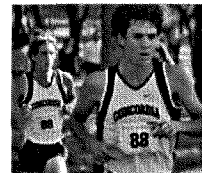
Concordia (Neb.) moves up one spot in this week's poll to No. 4

The poll was voted upon by a panel of head coaches representing each of the conferences. The next poll will be released on Sept. 30.