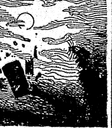
The cat that nightly haunts our gate. How beautifully we hate her! Some night she'll come and mew till late. But we will nu-ti-late her!

Mothers! This wonderful remedy will save your child's life when attacked by Croup. It always cures Whooping and Measle Cough. For a bad, stubborn cold in the head, chest, throat or lungs, it is invaluable. Doses are small. Children like it. Sold by all druggists. Price 25 cents.