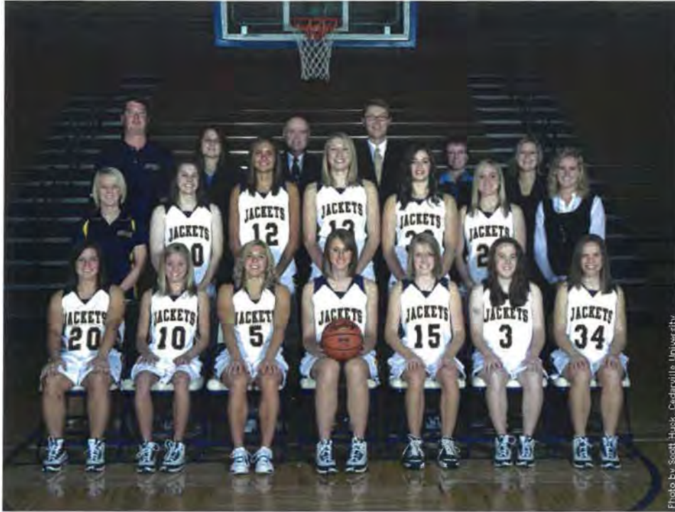
The 2008-09 Lady Jackets